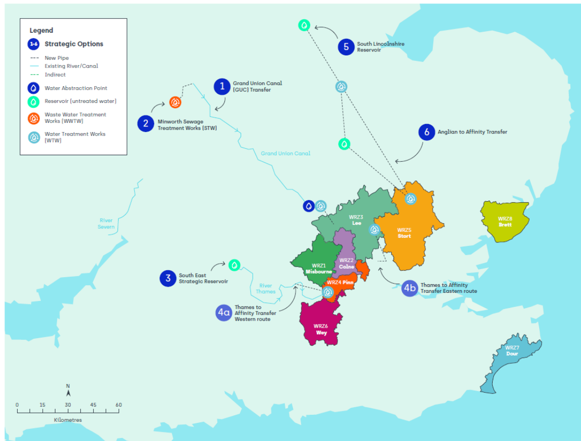
Figure 1: Affinity Water Strategic Resource Options 2